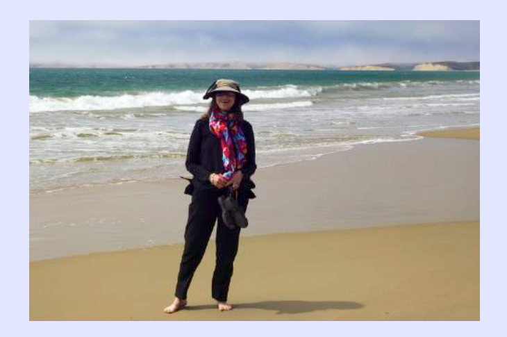
Seven Stages to a More Joyful You! © May 2014 AwakeningYourTrueSelf.com